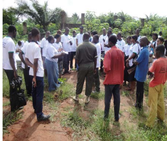
Climate Justice Training in Benin: Tree planting